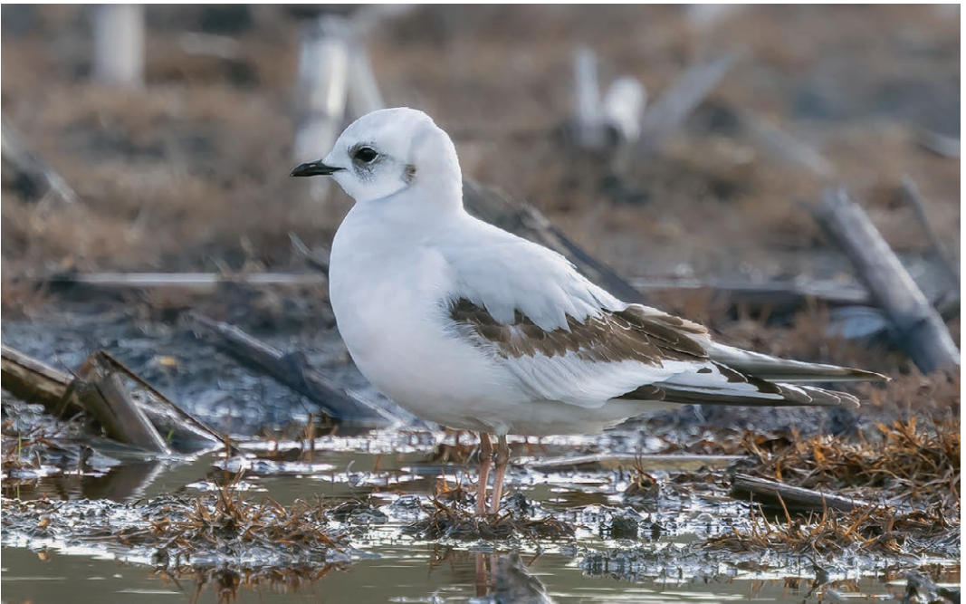
565 Ross's Gull / Ross' Meeuw Rhodostethia rosea , second calendar-year, Waterzuivering Eversteekoog, Texel, Noord-Holland, 25 April 2023