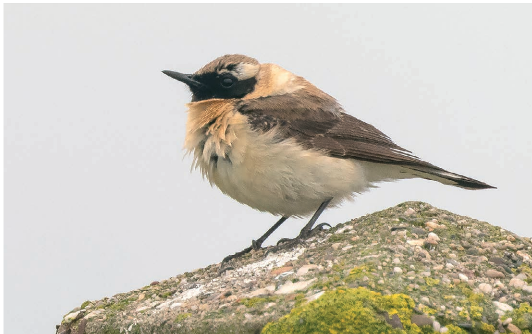
574 Eastern Black-eared Wheatear / Oostelijke Blonde Tapuit Oenanthe melanoleuca , second calendar-year male, Koehool, Friesland, 22 April 2023 (Maarten Hotting)