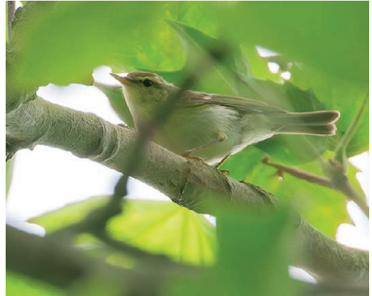
572 Green Warbler / Groene Fitis Phylloscopus nitidus , adult, Ovezande, Zeeland, 6 July 2023 (Thomas Luiten)

An excellent find by one of the best rarity finders, and this in his garden! After the first two in June, this is the first in July. With quite a few recent records in north-western Europe, this species is now on many birders' radar in late spring. Including pending records there are now 13 for Britain, of which 12 since 2014 and all but two in May-July, with singles in September and October.