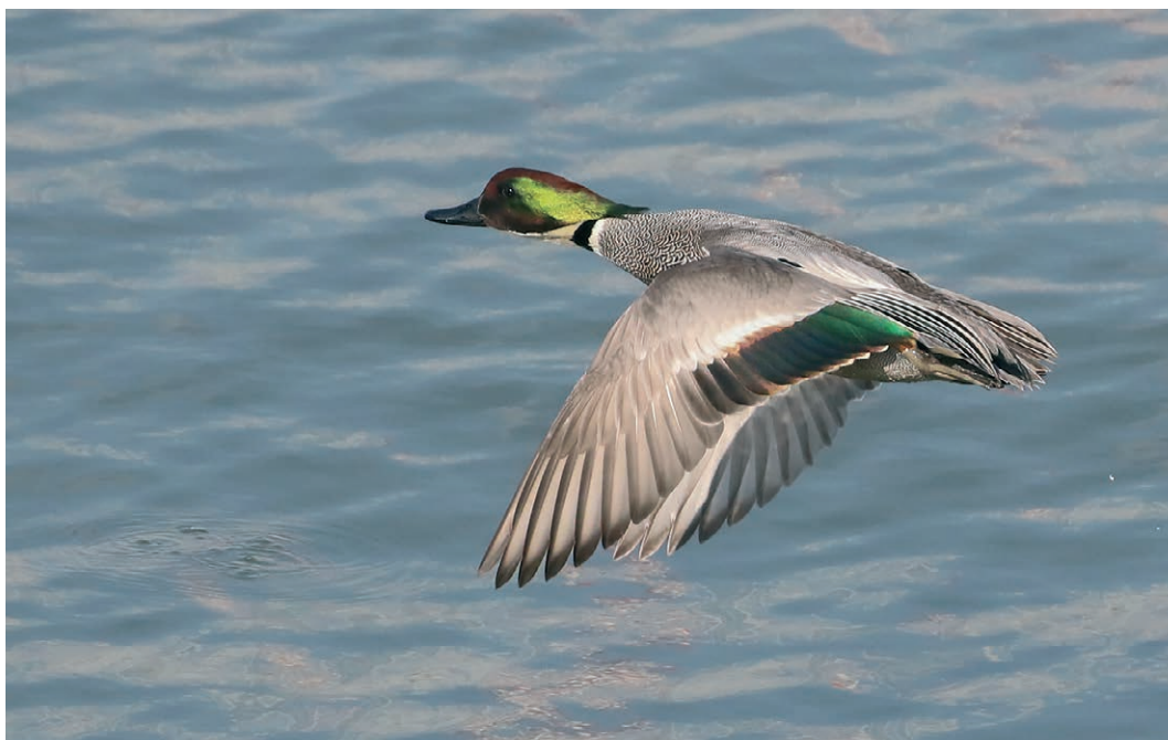
558 Falcated Duck / Bronskopeend Mareca falcata , adult male, Botlek, Rotterdam, Zuid-Holland, 21 April 2023 (Tseard Mulder)