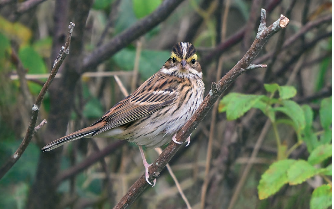
577 Yellow-browed Bunting / Geelbrauwgors Emberiza chrysophrys , first calendar-year male, Oost-Vlieland, Vlieland, Friesland, 28 October 2023 (Wietze Janse)