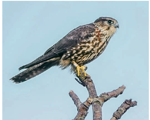
566 Blue-cheeked Bee-eater / Groene Bijeneter Merops persicus , adult, Fochteloërveen, Friesland, 5 August 2023 567 Lesser Kestrel / Kleine Torenvalk Falco naumanni , first calendar-year female, Bentwoud, Zuid-Holland, 10 September 2022 568 Icelandic Merlin / IJslands Smelleken Falco columbarius subaeson , first calendar-year female, Noordhollands Duinreservaat, Castricum, Noord-Holland, 22 November 2022 569 Icelandic Merlin / IJslands Smelleken Falco columbarius subaeson , first calendar-year female, Noordhollands Duinreservaat, Castricum, Noord-Holland, 24 November 2022

maximum wing length in females of F. c. aesalon from Europe (not in Iceland) is well short of this length. The previous six records were all of birds found dead between 1854 and 1950. This was, therefore, quite a remarkable record but, as F. c. subaeson occurs regularly in winter in France and has even reached Spain as evidenced by ring recoveries, it might be overlooked in the Netherlands.