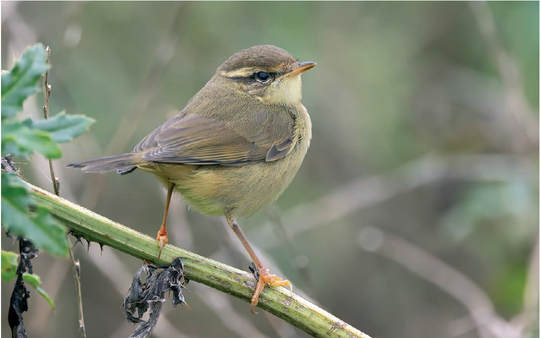
573 Radde's Warbler / Raddes Boszanger Phylloscopus schwarzi , first calendar-year, Maasvlakte, Zuid-Holland, 12 November 2023