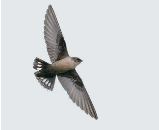
571 Eurasian Crag Martin / Rotszwaluw Ptyonoprogne rupestris, first calendar-year, Doornenburg, Gelderland, 26 November 2023