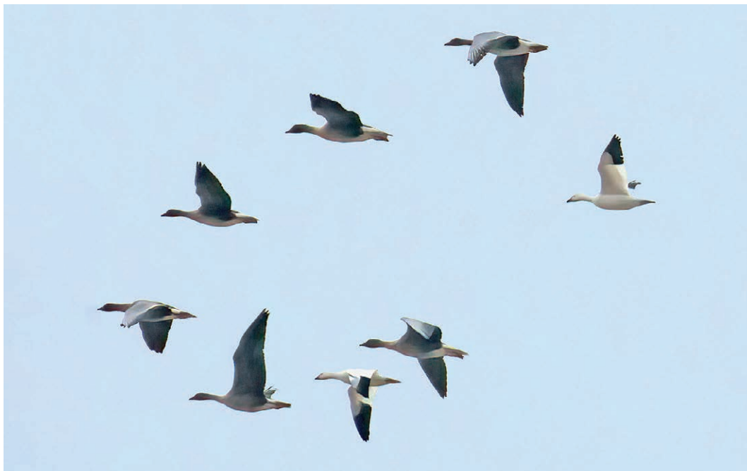
557 Ross's Geese / Ross' Ganzen Anser rossii , with Pink-footed Geese / Kleine Rietganzen A brachyrhynchus , De Vulkaan, Westduinpark, Den Haag, Zuid-Holland, 8 October 2023