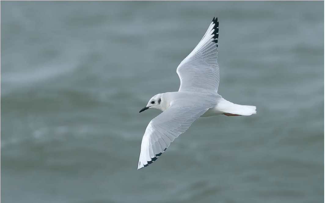
564 Bonaparte's Gull / Kleine Kokmeeuw Chroicocephalus philadelphia , adult winter, Westkapelle, Zeeland, 27 October 2023