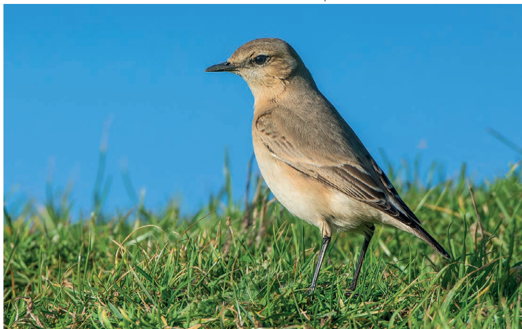
575 Isabelline Wheatear / Izabeltapuit Oenanthe isabellina , Prins Hendrikzanddijk, Texel, Noord-Holland, 11 November 2023