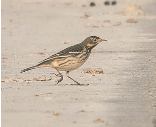
579 Siberian Buff-bellied Pipit / Siberische Waterpieper Anthus japonicus , 's-Gravendeel, Zuid-Holland, 10 February 2023 (Eduard Sangster)