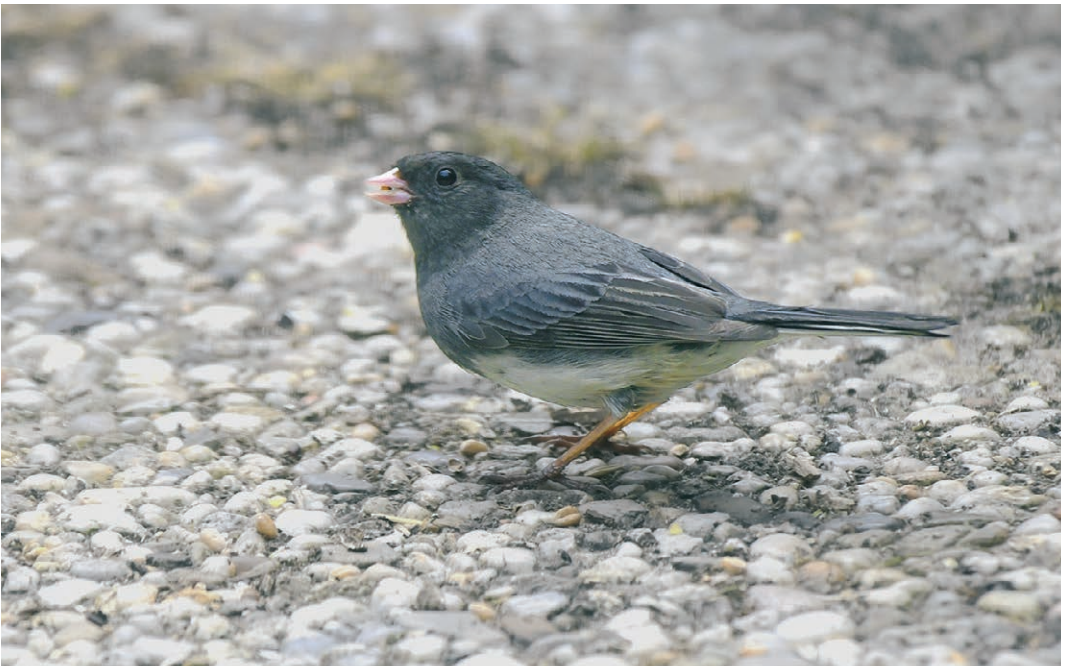
578 Dark-eyed Junco / Grijze Junco Junco hyemalis , second calendar-year male, Hippolytushoef, Noord-Holland, 7 May 2023 (Jan van der Laan)