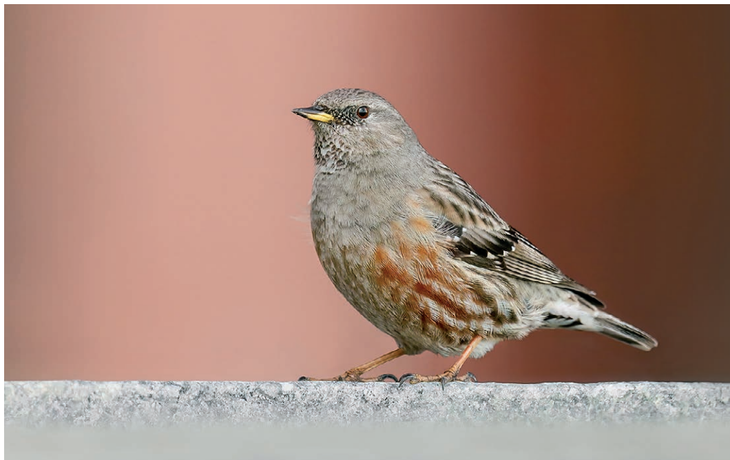
576 Alpine Accentor / Alpenheggenmus Prunella collaris , second calendar-year, Den Haag, Zuid-Holland, 23 March 2023