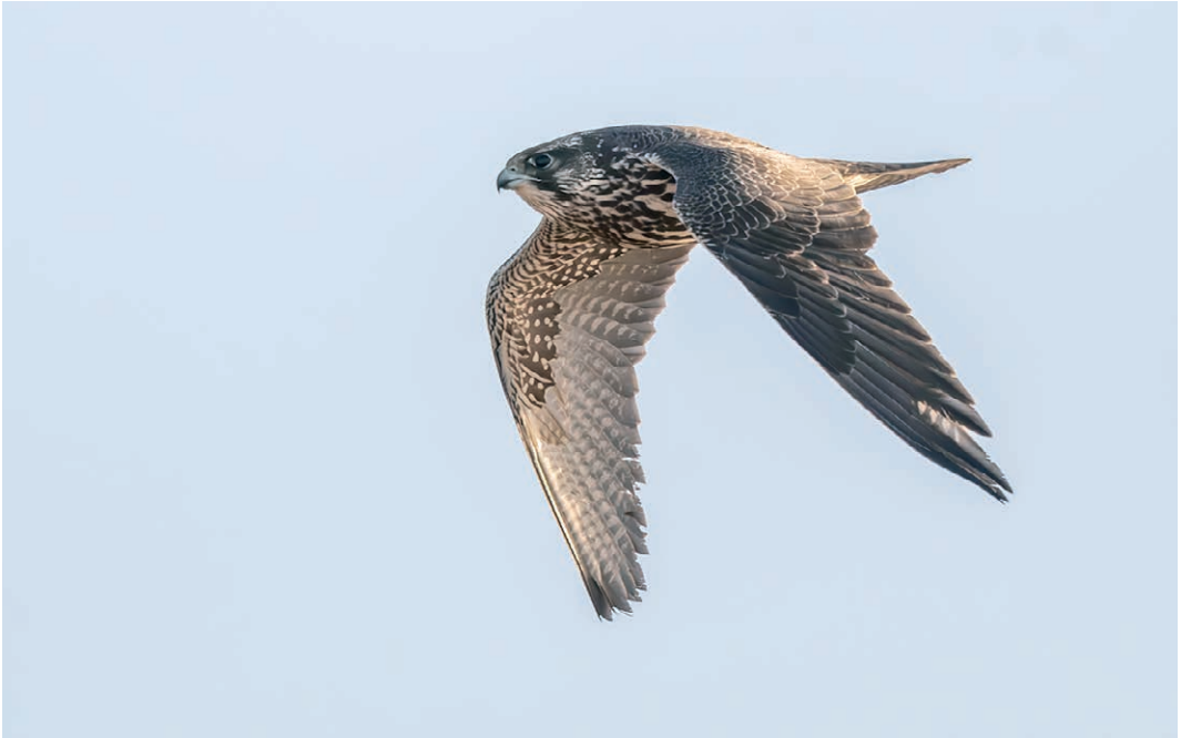
570 Gyrfalcon / Giervalk Falco rusticolus , second calendar-year, De Slufter, Texel, Noord-Holland, 2 February 2024