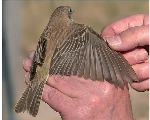
580 Black-headed Bunting / Zwartkopgors Emberiza melanocephala , female, Noordhollands Duinreservaat, Castricum, Noord-Holland, 13 June 2023 (Hans Schekkerman)

clude American Buff-bellied Pipit A. rubescens . The only records in European countries bordering the Atlantic Ocean or North Sea are in France (one; wintering from 22 December 2018 to 12 January 2019) and Norway (two), with other records as far north as Finland (one) and Sweden (five). The search continues for the first American Buff-bellied Pipit; with c 45 records from Iceland and more than 60 from Britain, that species is widely predicted to be one of the next additions to the Dutch avifauna.