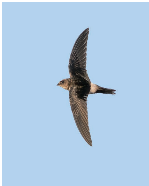
561-562 Horus Swift / Horusgierzwaluw Apus horus , juvenile, Westerplas, Schiermonnikoog, Friesland, 27 September 2019